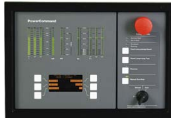
Optional features shown